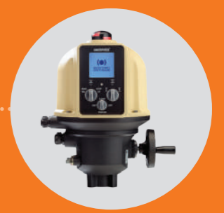
AQ5 - AQ10 - AQ15 - AQ25 - AQ30 - AQ50 - AQ80 - AQ100 AQ150 - AQ280 - AQ430 - AQ610 - AQ830 - AQ1000 LOGIC version