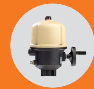
AQ5 - AQ10 - AQ15 - AQ25 - AQ30 - AQ50 - AQ80 - AQ100 AQ150 - AQ280 - AQ430 - AQ610 - AQ830 - AQ1000 SWITCH version